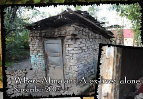
Where Alina and Alex lived alone. September 2007