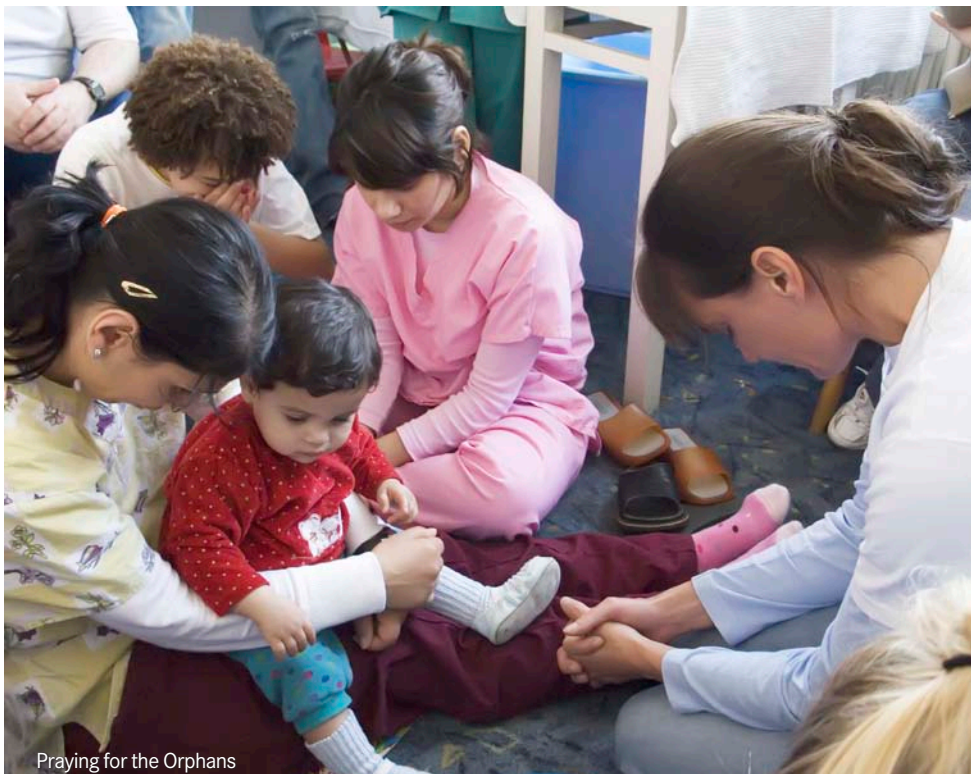
Praying for the Orphans